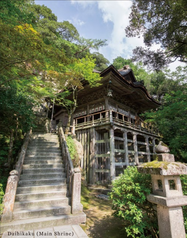
Daihikaku (Main Shrine)